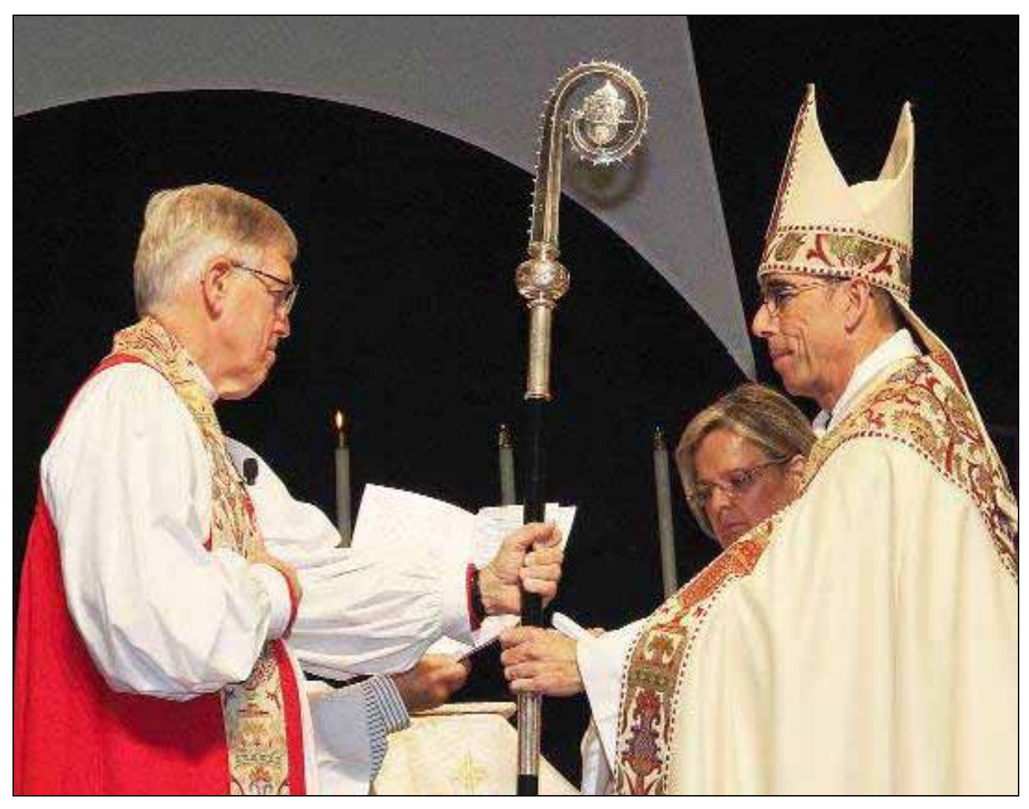
Bishop Gray Passes the Crosier to Bishop Seage